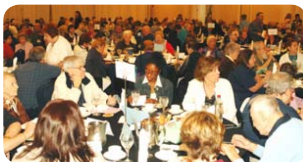
On November 5th participants came from cities throughout Illinois for a conference dedicated to people living with COPD.

September. The 2nd annual Hike for Lung Health was held in September at Chicago and Palatine. This year 65 participants from 9 different groups joined hikers as virtual walkers —walking during pulmonary rehab time or on their own. On the day of the event there were nearly 1000 hikers and volunteers who participated; we raised nearly $140,000!