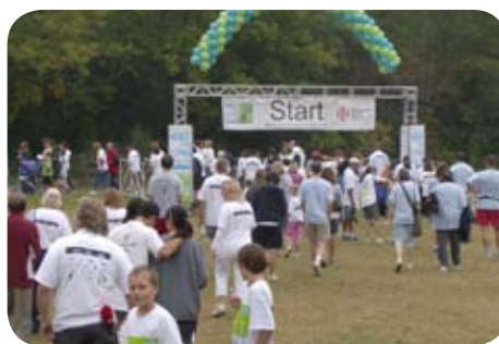
On September 21st walkers came out to Chicago and Palatine to raise funds for lung health programs and research.

June. On a gorgeous summer day in June, over 500 people living with COPD and their caregivers joined RHAMC for Cruising with COPD in Chicago. We cruised from Navy Pier on the Spirit of Chicago and Odyssey ships, shared a delightful lunch, played COPD Bingo and witnessed the Chicago skyline on a wonderful summer day.