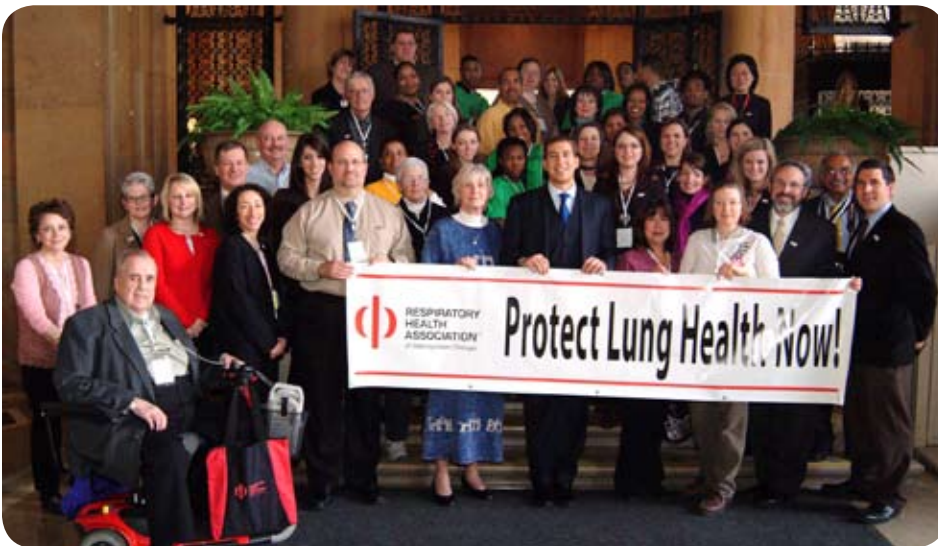
Lung health advocates show their support in Washington, DC at the first United for Lung Health Federal Advocacy Day.

2008 has been a monumental year for COPD at RHAMC and throughout Illinois! This year, COPD was a common theme throughout all of our RHAMC activities from special fund-raising events to state policy efforts.