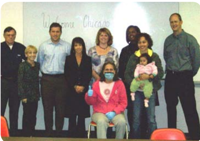
The Chicago Alphas Support Group meeting held on October 18, 2008.