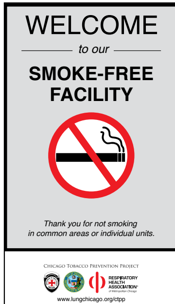
Indoor and outdoor signs